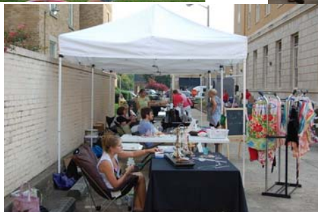
Photos from August 26th Old Town Market