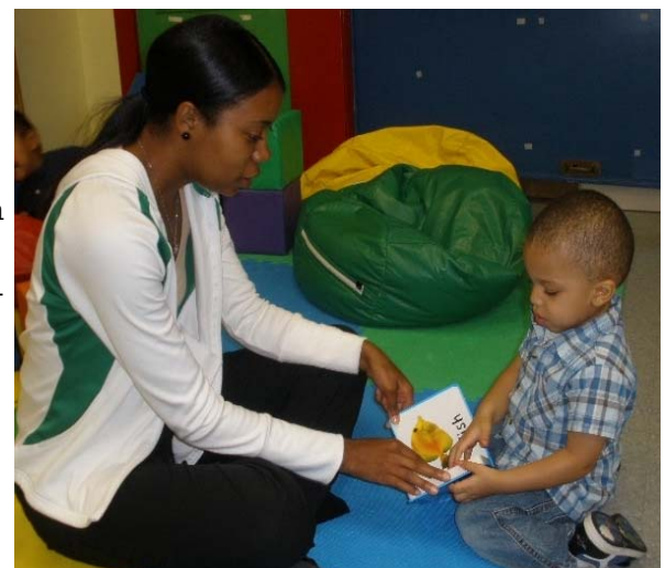
A mother reading with her child during a literacy activity at the Rock Hill Resource Center.

The ELP office, once located on Winthrop's campus, recently moved to the heart of Old Town at 114 E. Main Street. For more information, call ELP at 803-323-2180 or visit the new web-site or facebook page.