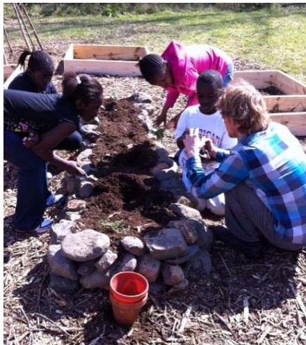
Preparing beds for planting with children from the neighborhood.

South Central Neighborhood Garden was created to foster connections between area residents, while providing access to healthy foods through gardening.