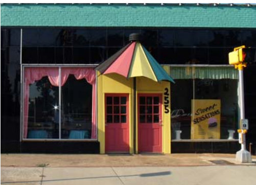
Street view of Sweet Sensations Sweet Shoppe.

Sweet Sensations also offers catering services. “Candy bars” can be custom-created for weddings, showers, and other special occasions. In addition, homemade brownies, muffins, pound cakes, cookies, pastries, or cake