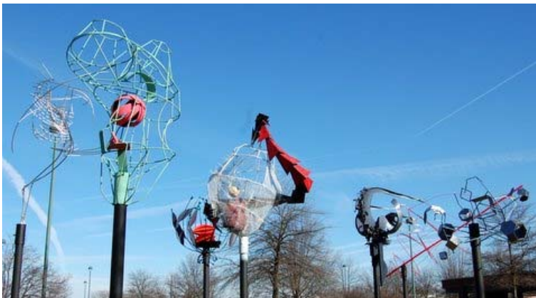
Main Street Sculpture Gallery's newest works of art.

E. Main Street and Dave Lyle Boulevard. The new works replaced the majority of the ones that were installed there a year ago.