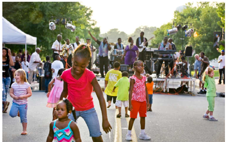
Kids enjoying Main Street Live during last year's concert series.