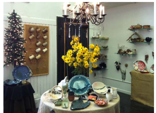
The newly-renovated shop at the Rock Hill Pottery Center.

The Rock Hill Pottery Center is located at 201 E. Main Street. It is open every Monday—Friday from 10am to 4pm.