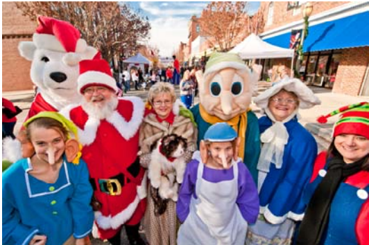
The ChristmasVille characters are excited to return for this year's festival!