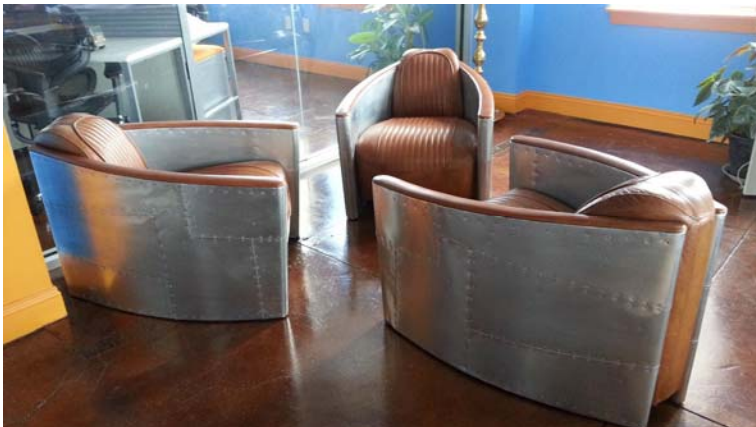
Aviator chairs at SPAN Enterprises.

Span Enterprises adapts, builds, and creates products in-house to enhance and improve the way companies function. All products are customized to meet companies' specific needs. With excellent customer service and a passion for web-based application development, Span Enterprises believes the possibilities are endless.