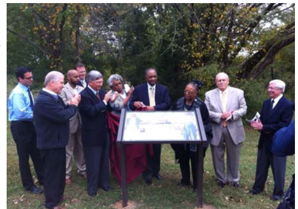
Unveiling of the last ArcadeMill Historic Marker.

recent project, Cotton Mill Village. This project included the rehabilitation and conversion of the Rock Hill Body Company's building and property on Hardin and W. Main Streets into affordable housing: 21 apartments and 18 rental homes.