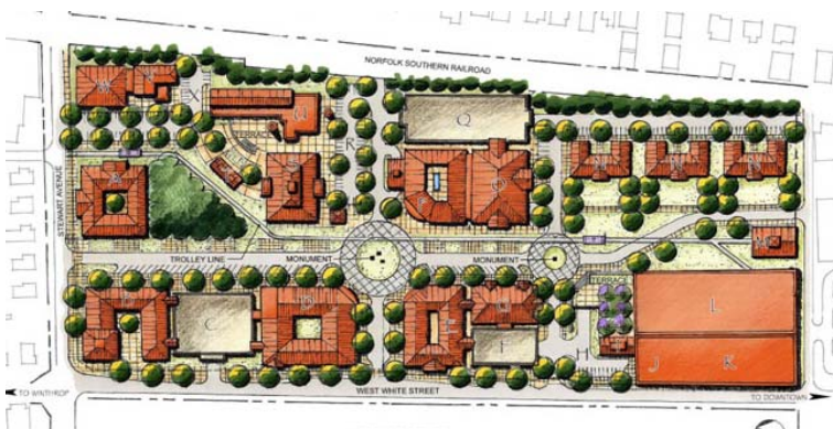
Master Plan rendering by Sora-Phelps.